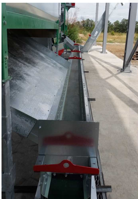
TSP flat carpet