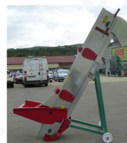
Elevator on fixed trolley (ELB0005)