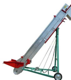
Elevator on mobile cart Small model (ELE0157) (for ELB 3m and 3m50) Medium model (ELE0158) (for ELB 4m and 4m50) Big mobil model (ELE0159) (for ELB 5m to 6m)