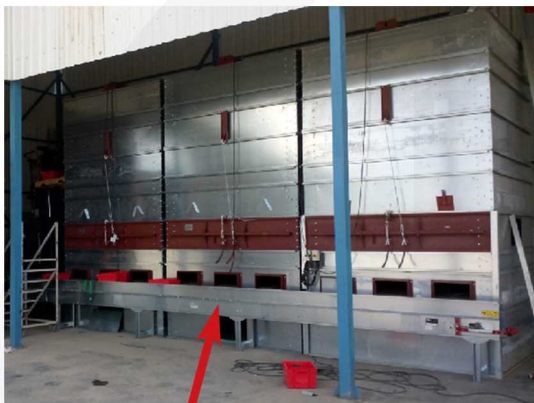
TSC Exit Carpet for Dryer