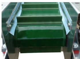
Edged carpet sealing (ELB0140)