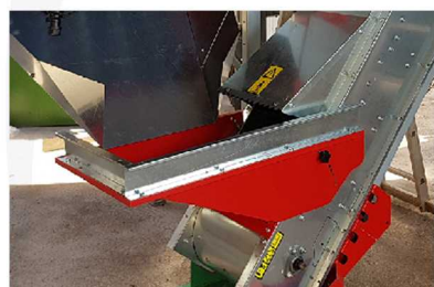
Straight hopper with extension (ELE0206 - ELE0198 - ELE0217 - ELE210)