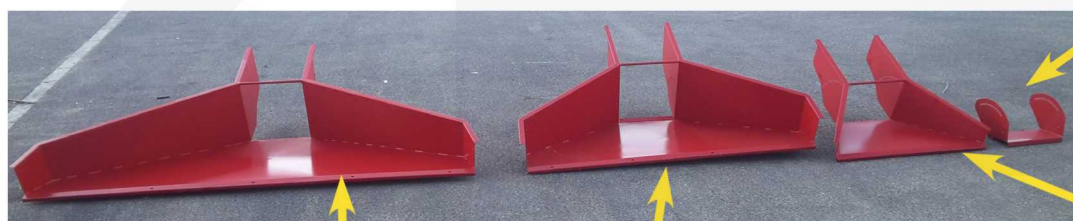
Hopper 2 600 mm (ELE0003 and ELE0185)